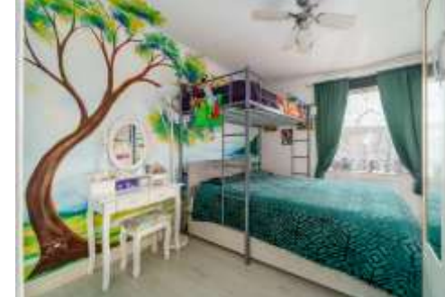
Vanguard House, Douglas Road, Staines-upon-Thames, TW19 7JW £215,000 - Leasehold

A well presented one-bedroom first floor purpose-built flat, conveniently situated within close proximity of the many local amenities on Stanwell High Street. Occupying approximately 530 sq/ft of internal living space, the accommodation briefly comprises of entrance hallway, double bedroom, large reception/living room, modern fitted kitchen and modern fitted shower room. This light and airy property further boasts gas central heating, double glazing, new laminate flooring, plenty of storage space, a long lease, communal gardens and parking. Sole Agent.