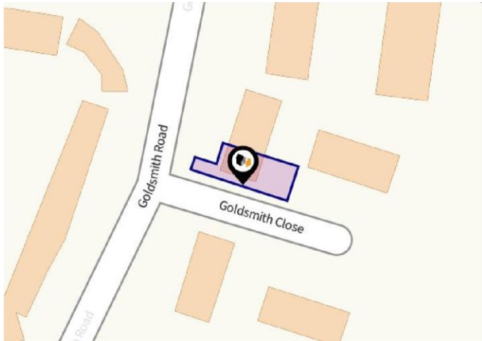
Boundary (Land Registry Title Plan)