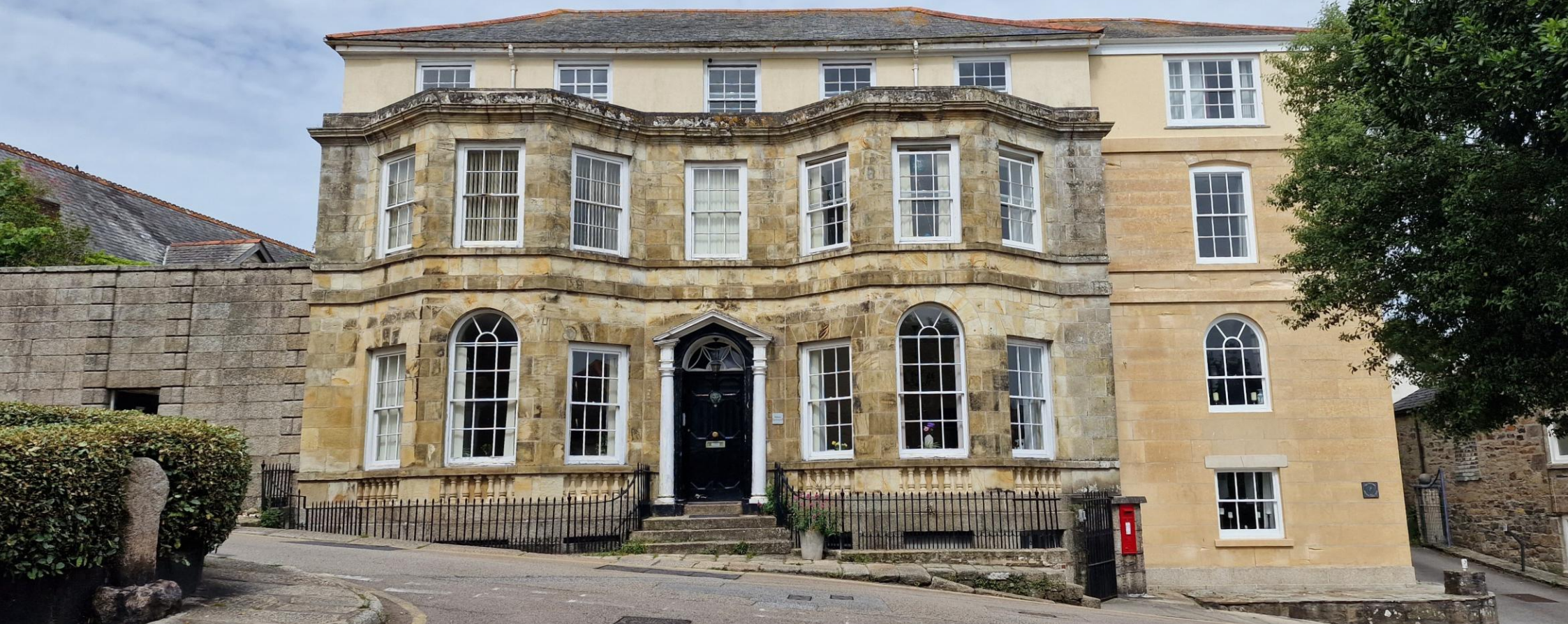
The Willows, Church Street Guide Price £135,000