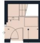
Hallway 2.27 x 1.31 m 7'5" x 4'3"