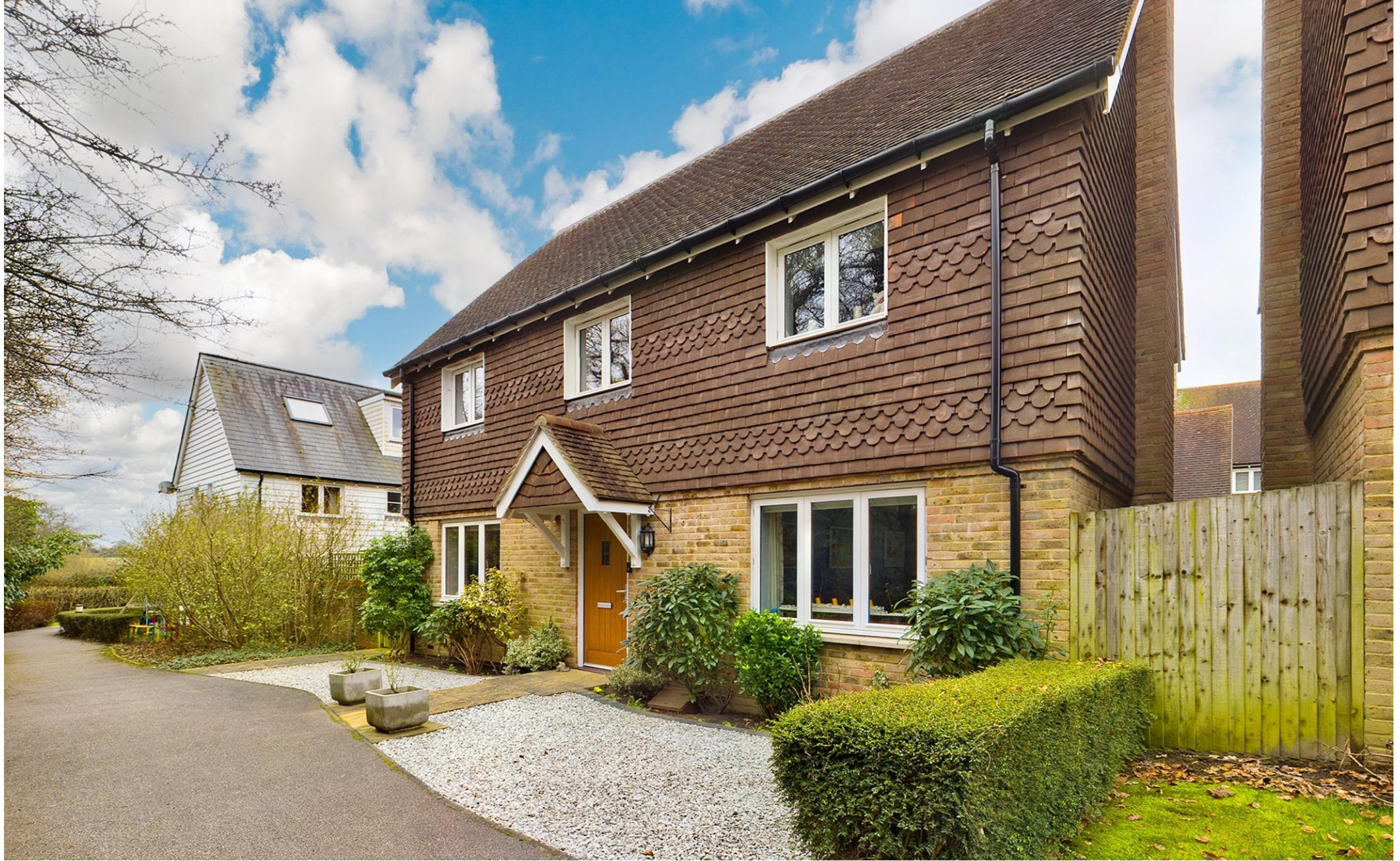
Trinity Fields, Lower Beeding, Horsham, RH13 6GH. Guide Price £575,000 Freehold