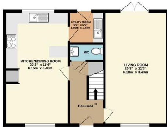
GROUND FLOOR 606 sq.ft. (56.3 sq.m.) approx.