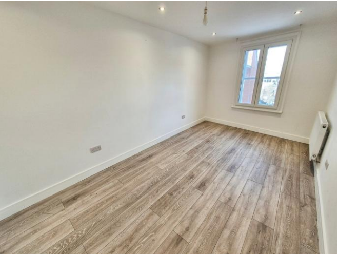
BEDROOM ONE 15' 8" x 8' 7" (4.8m x 2.63m) Side aspect window, laminate flooring and a radiator.