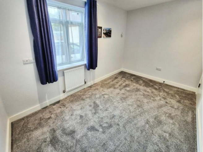
and laminate flooring.

BEDROOM 12' 10" x 8' 7" (3.92m x 2.64m) Rear aspect window, carpet and radiator.