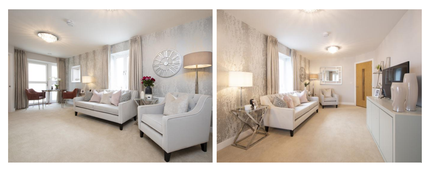
Please note that the photography depicts show apartments at this development. This property is offered for rent unfurnished.

In the vicinity, you'll find a convenient bus stop for easy town transportation, as well as essential amenities like doctors, a dentist surgery, pharmacy, a convenience store, and a family-friendly pub nearby.