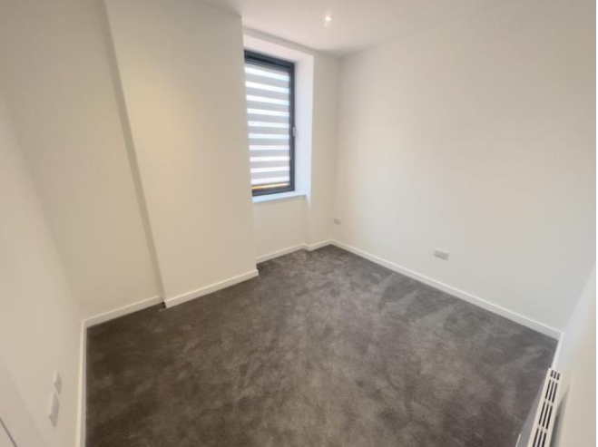
BEDROOM 11' 4" x 10' 4" (3.47m x 3.15m) Window with Combination blinds partial or full black-out, carpet and electric radiator

SHOWER ROOM Double-sized shower cubide, low level WC with soft close toilet seat, wash hand basin, thermostatic shower LED mirror with shaver socket and demister function, towel radiator, extractor fan and tiled flooring