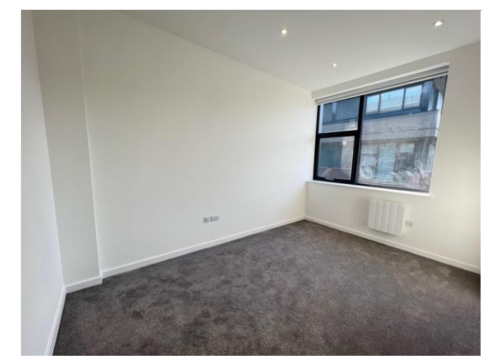
BEDROOM 2 7' 3" x 6' 1" (2.22m x 1.87m) Window with Combination blinds partial or full black-out, carpet and electric By law, Right to Rent checks must be carried and as such will radiator

BATHROOM Bath with shower over, low-level WC with soft close toilet seat, wash hand basin, the mostatic shower LED mirror with shaver socket and demister function, towel radiator and tiled floor