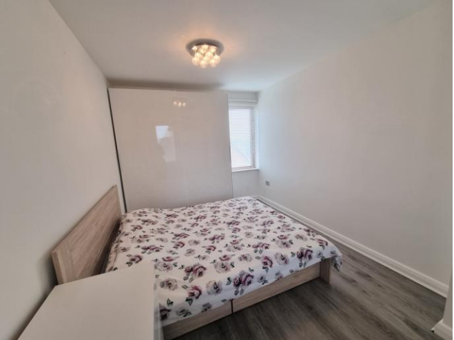
BEDROOM TWO 11' 6" x 7' 3" (3.50m x 2.20m) Front aspect window, laminate floor and radiator.

BATHROOM 7' 3" x 5' 7" (2.2m x 1.7m) Bath, low-level WC, wash hand basin, side aspect window, laminate floor and towel radiator.