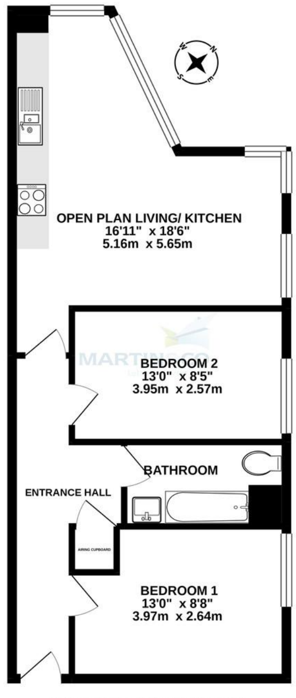
TOTAL FLOOR AREA: 610 sq.ft. (56.6 sq.m.) approx.

FREYA HOUSE 610 sq.ft. (56.6 sq.m.) approx.