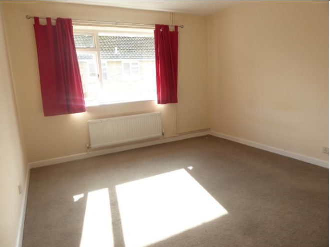
BEDROOM 1 12' 1" x 10' 11" (3.7m x 3.3m) Front aspect window, built in wardrobe, built in cupboard and radiator.