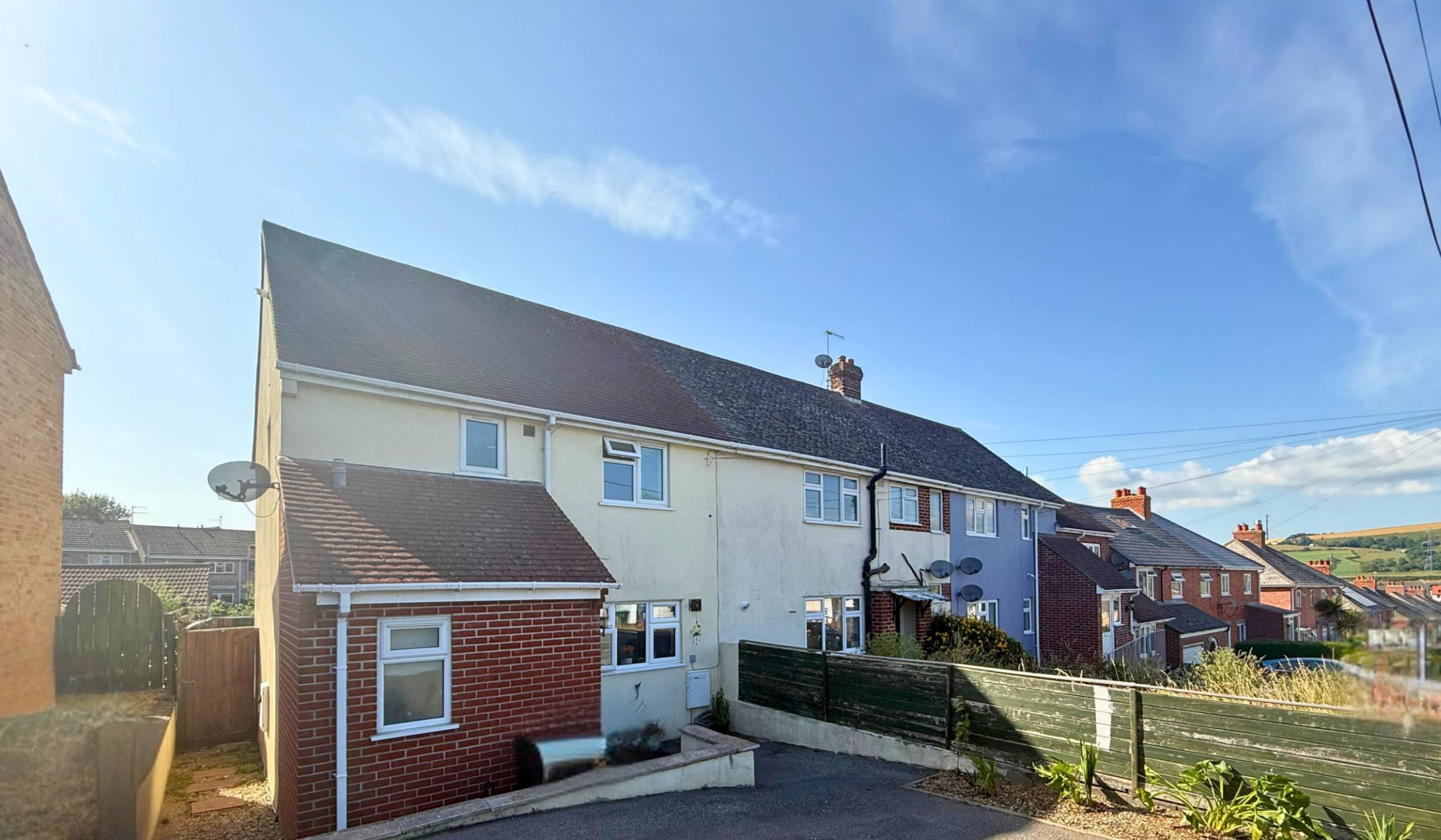
Canberra Road, Weymouth, DT3 6AH Asking Price Of £249,000 Freehold