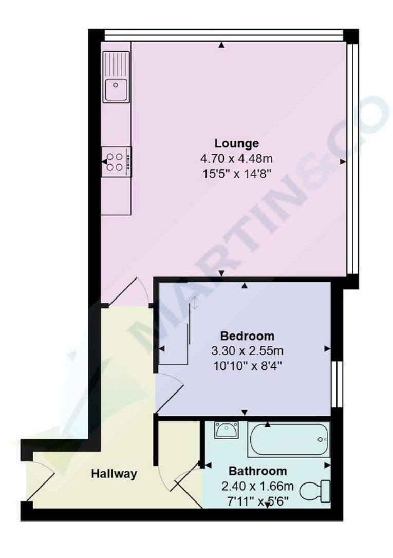
Total Area: 41.5 m<sup>2</sup> ... 446 ft<sup>2</sup>

All measurements are approximate and for display purposes only