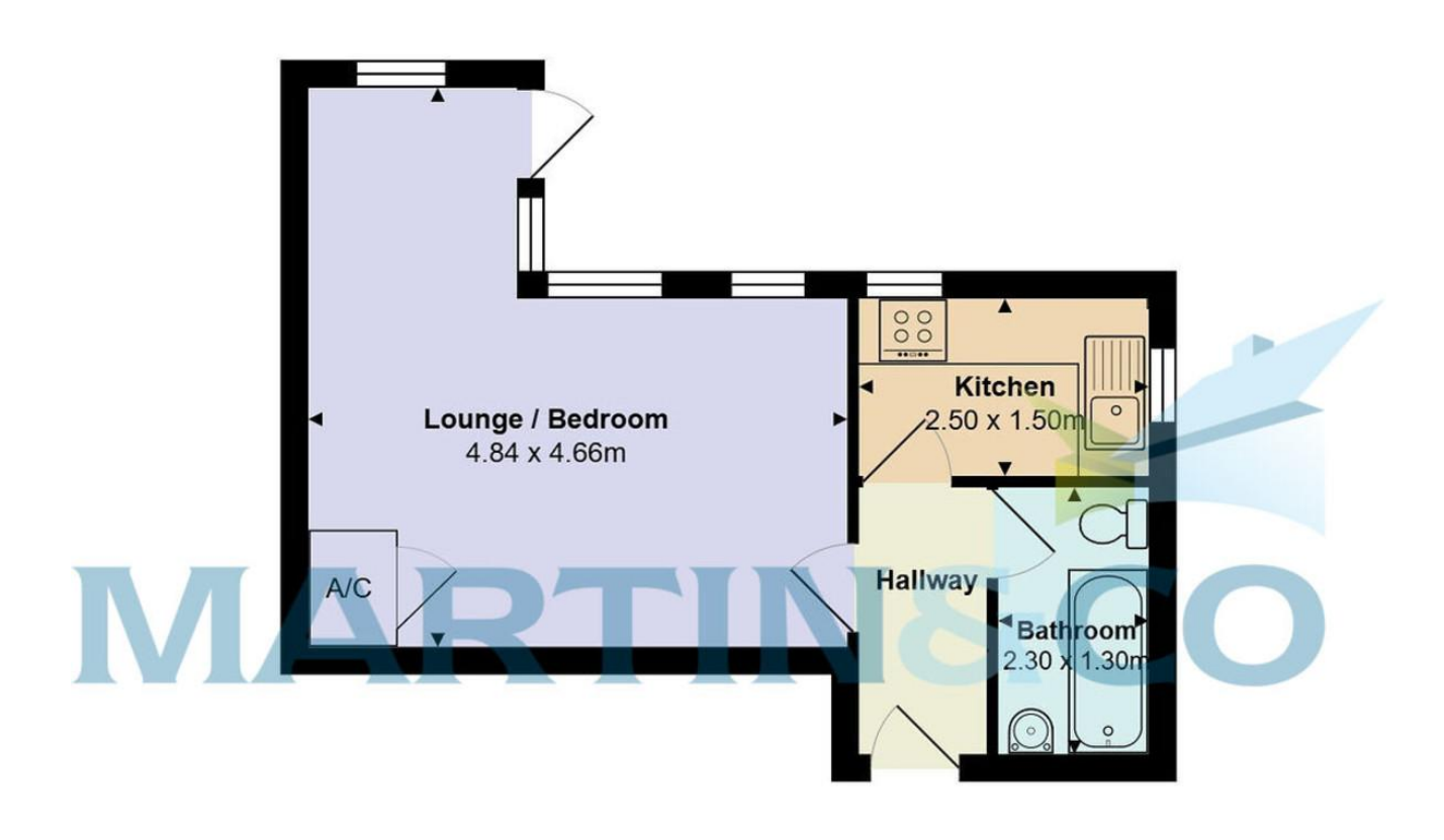
Total Area: 27.4 m<sup>2</sup> All measurements are approximate and for display purposes only