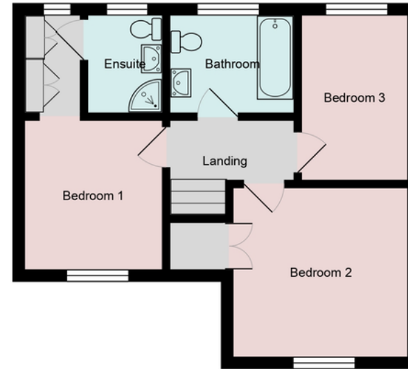
Floorplan is for illustrative purposes only and is not to scale.