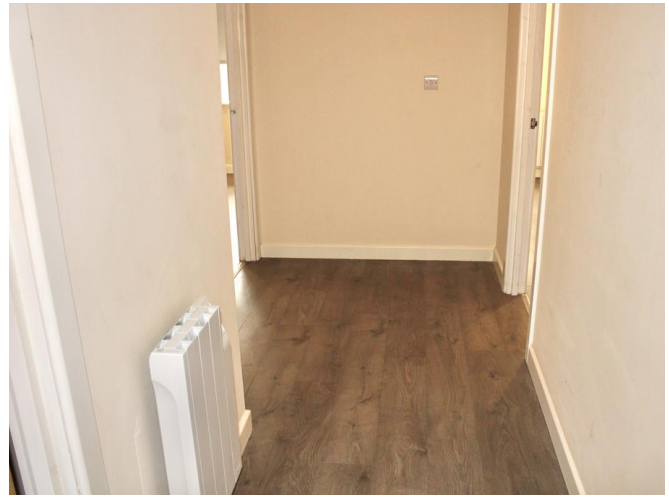
SOUTHAMPTON CITY COUNCIL BAND A