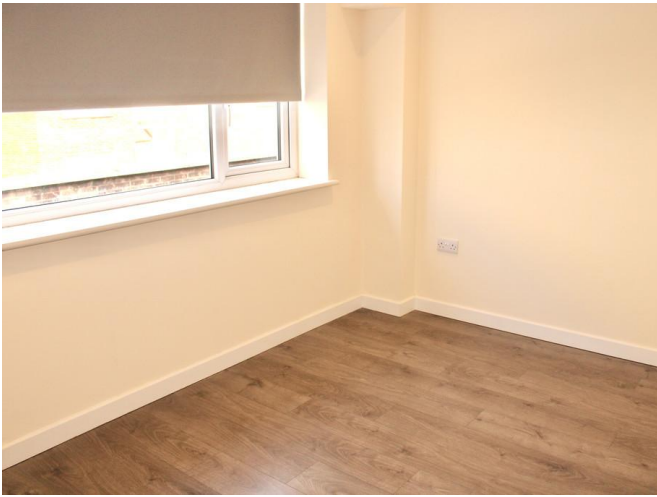
BEDROOM 2 4.08m x 2.78. Neutral décor with laminate flooring, window to front aspect.