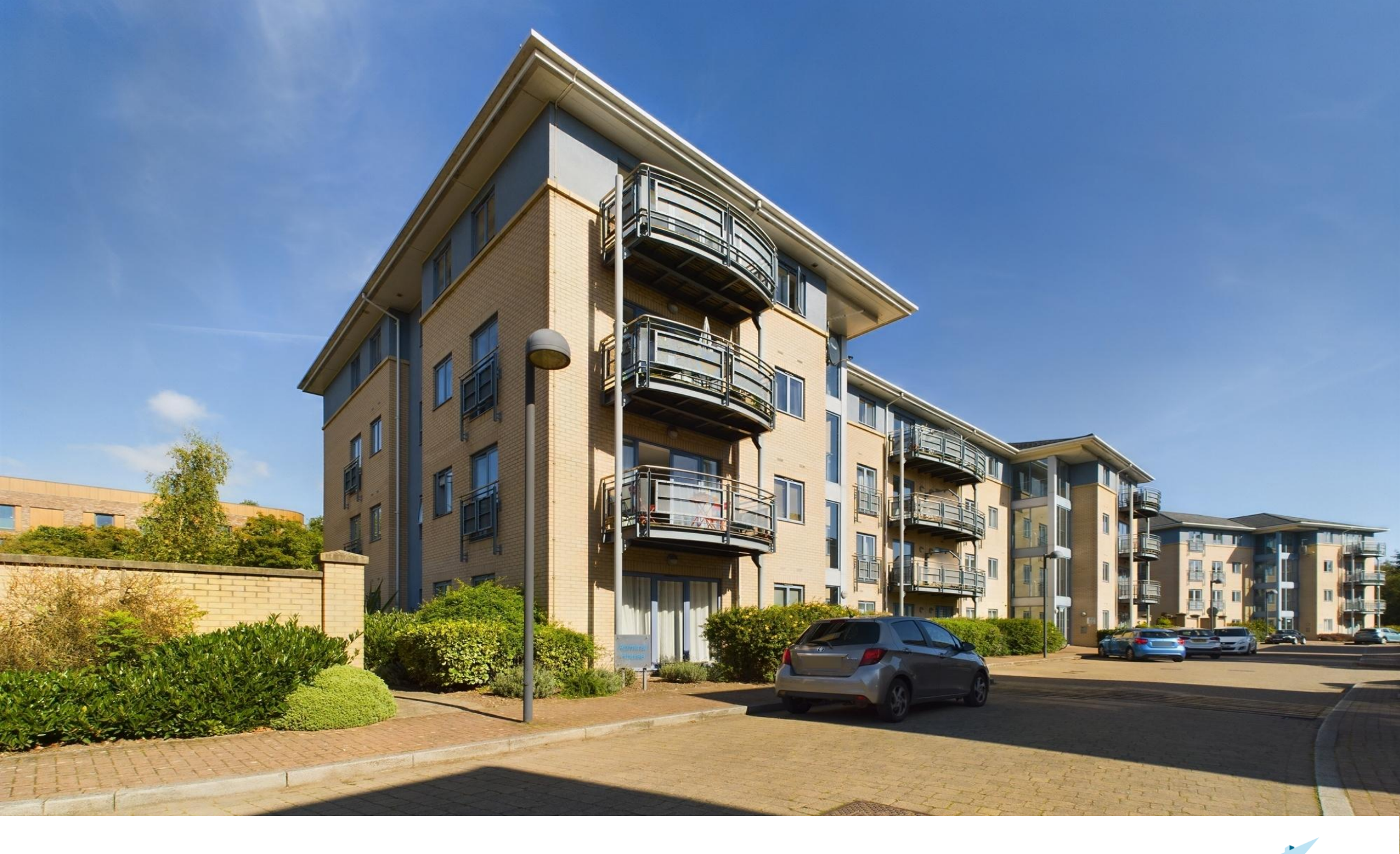
Admiral House, Castle Quay Close, Castle Marina, Nottingham, NG7 1HR Guide Price £190,000-£200,000 Leasehold MARTIN&CO