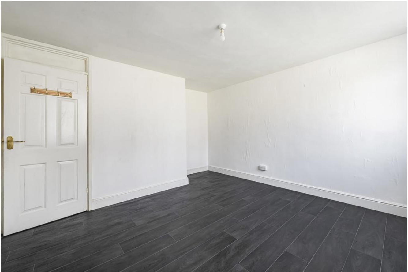
Spacious 3-Bedroom Ground Floor Apartment | Open-Plan Kitchen | Prime Selsdon Location | No Onward Chain