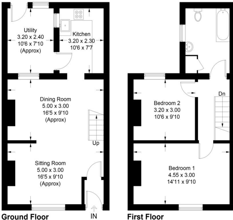
Illustration for identification purposes only, measurements are approximate, not to scale. Fourlabs.co © (ID1132740)