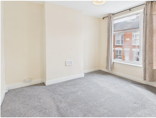
BEDROOM TWO 9' 5" x 11' 11" (2.87m x 3.63m)