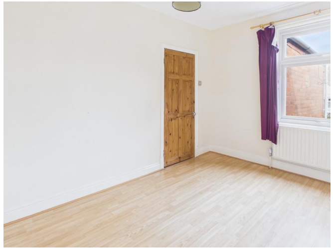
BEDROOM THREE 6' 2" x 12' 10" (1.88m x 3.91m)