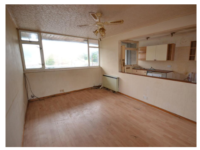
BEDROOM 12' 1" x 6" 6" (3.68m x 1.98m) With window LOUNGE 14' 11" x 9' 7 " (4.55m x 2.92m) Measuring to the rear aspect of the home.

BEDROOM ONE 12" 1" \times 9' 11" (3.68m \times 3.02m) Benefiting from a window to the rear aspect of the home.