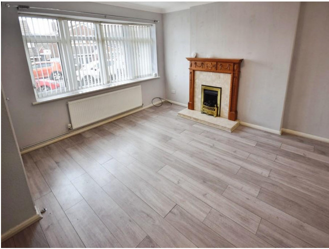
BEDROOM window to front, radiator, laminate flooring