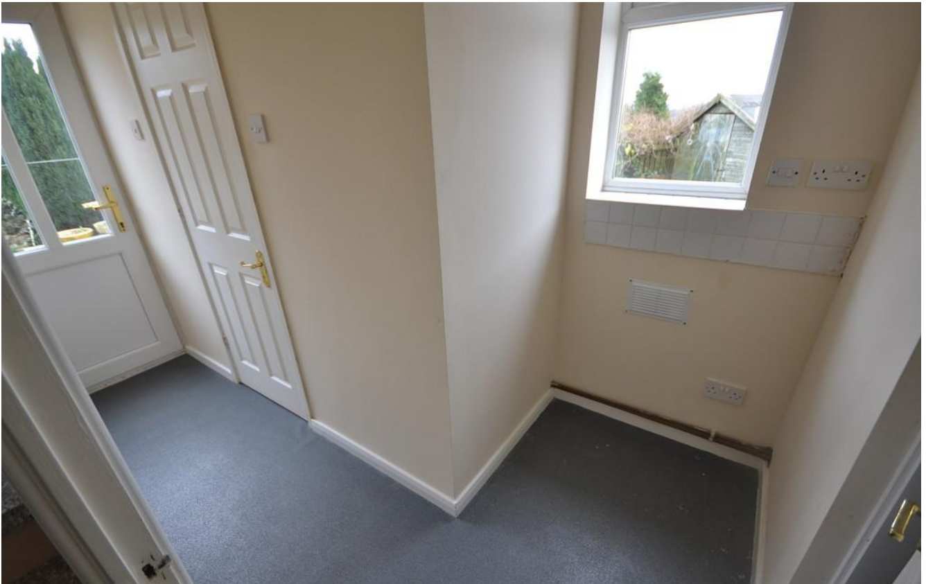
BEDROOM 5/ RECEPTION ROOM Window, radiator