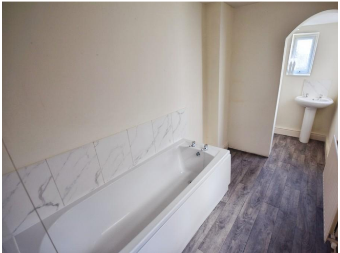
BATHROOM Three piece white suite comprising of WC, Wash Hand Basin and Bath, three frosted UPVC double glazed windows, wall mounted radiator.