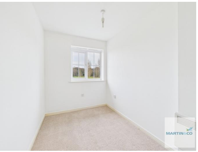
GENERAL INFORMATION COUNCIL TAX BAND - B

FIXTURES AND FITTINGS as per sales brochure.