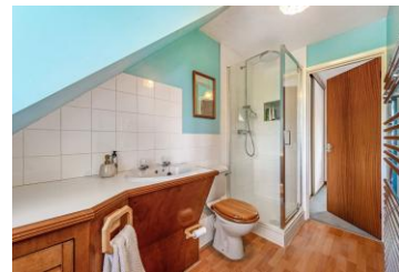
Photos above of downstairs bathroom and upstairs shower room