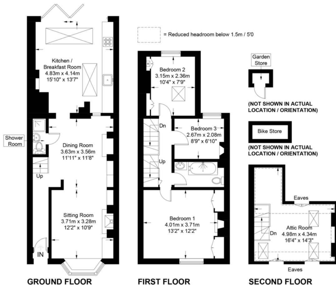
GROUND FLOOR FIRST FLOOR SECOND FLOOR These plans are for representation purposes only as defined by RICS - Code of Measuring Practice. Not to Scale. Created by Emzo Marketing (ID1289477)