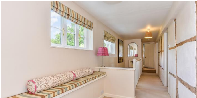
BEDROOMS & BATHROOMS: There are three further double bedrooms, one of which also has a vaulted ceiling and exposed timbers, and a bathroom and shower room situated at either end of the landing.