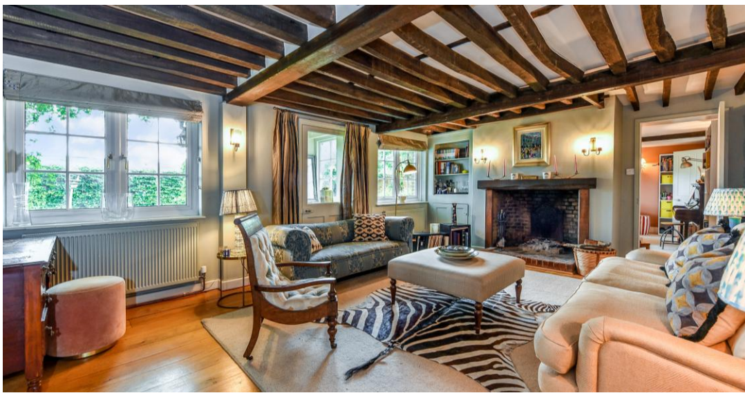
DRAWING ROOM: has a striking brick fireplace under an oak surround, with alcove cupboards to one side, and a door to the sitting room on the other.

The original entrance to the cottage is now a log store, and there are windows to either side of the former entrance, bathing the room with light, all of which sit under an original beamed ceiling, with higher than anticipated ceiling heights.