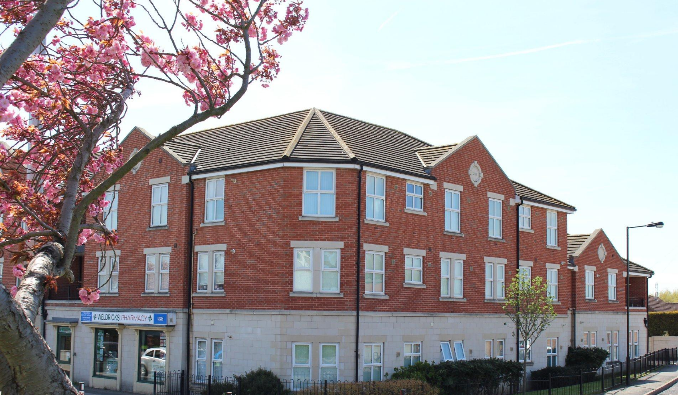
Burgh House, Skellow, DN6 8QU £65,000 Freehold