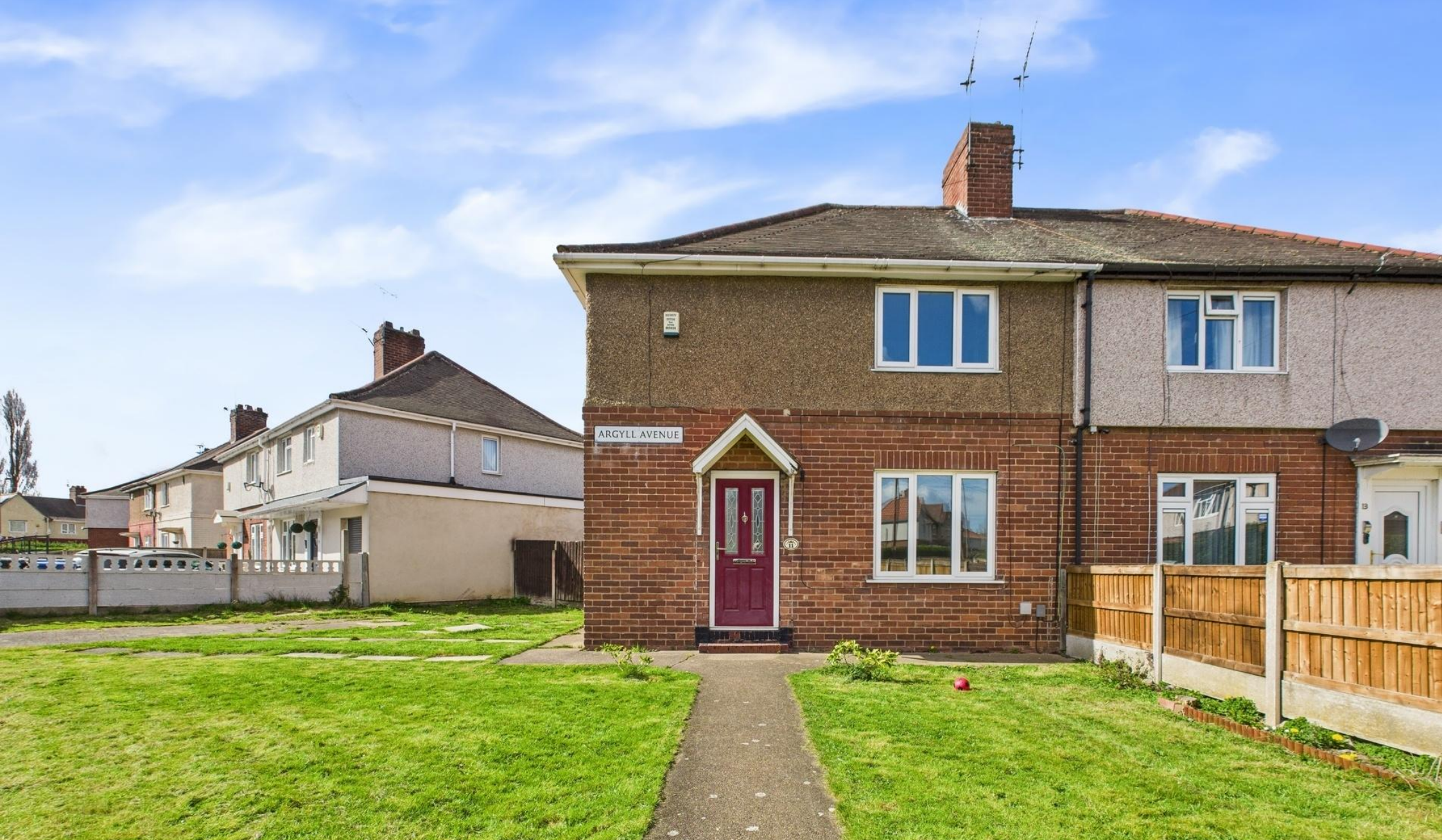
11 Argyll Avenue , Doncaster , DN2 6LF £150,000 Freehold