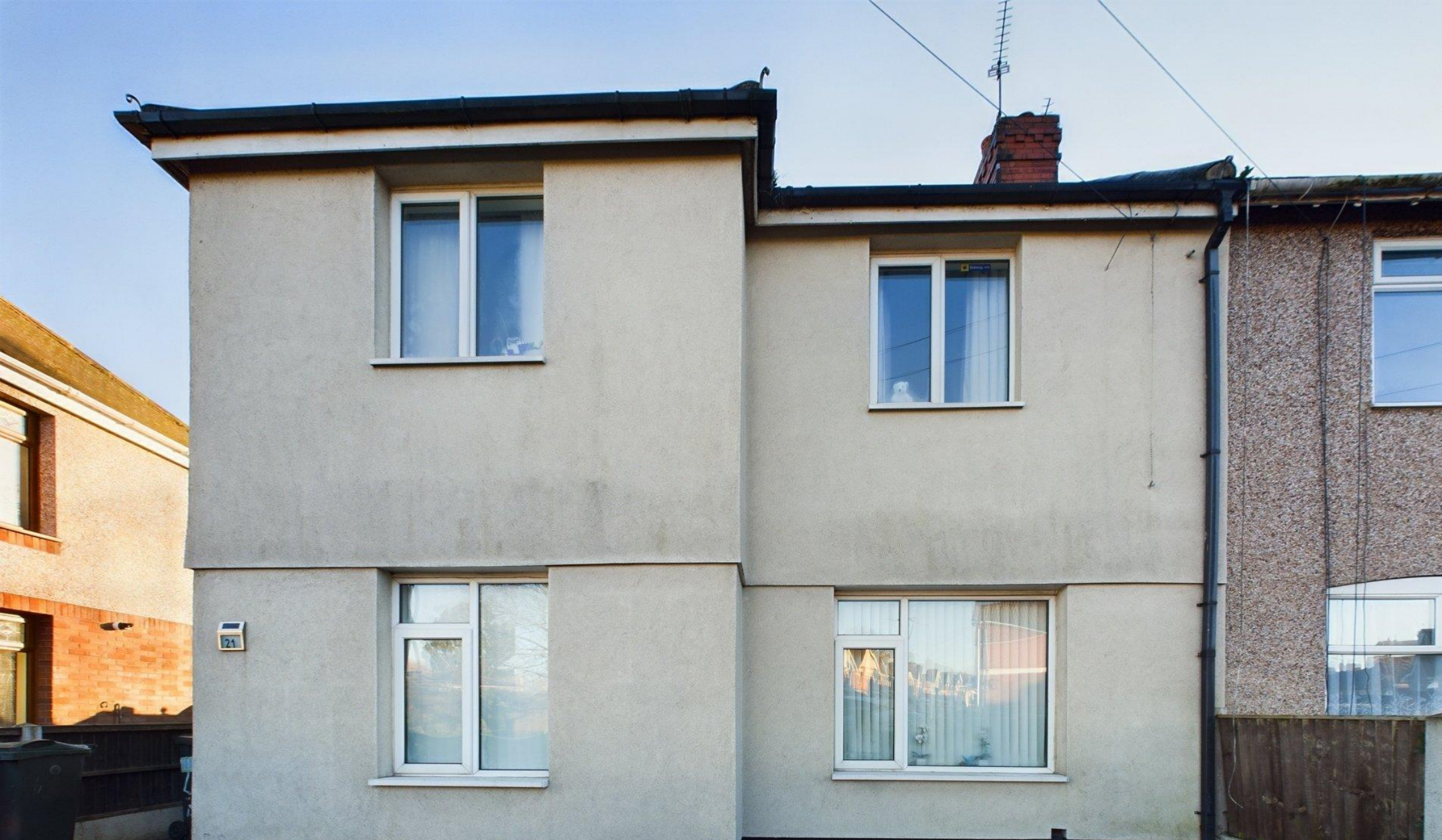
21 Daw Lane , Doncaster , DN5 0PE Asking Price Of £155,000 Freehold