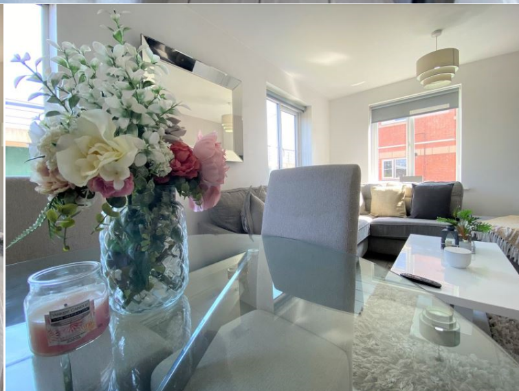
Anderson Grove , Newport, NP19 4DB

Rental £950 Monthly 2 Bedroom Flat / Apartment Available Now