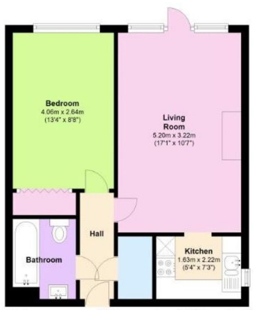
Total area: approx. 41.5 sq. metres (446.8 sq. feet)